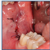
Within 15 seconds, BioViva becomes viscous