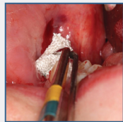
Place BioViva onto the wound or extraction site with forceps