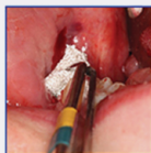
Place BioViva onto the wound or extraction site with forceps