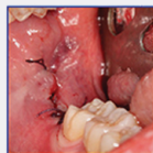
Within 15 seconds, BioViva becomes viscous